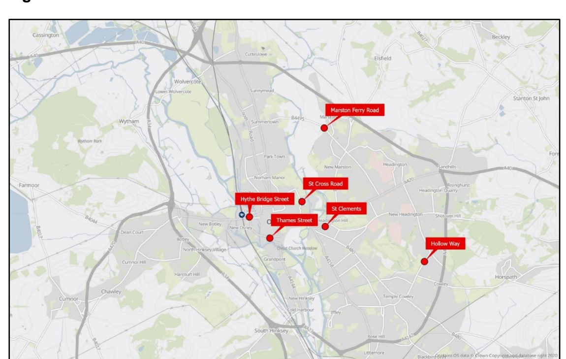
Figure 1 - Locations of the six traffic filters